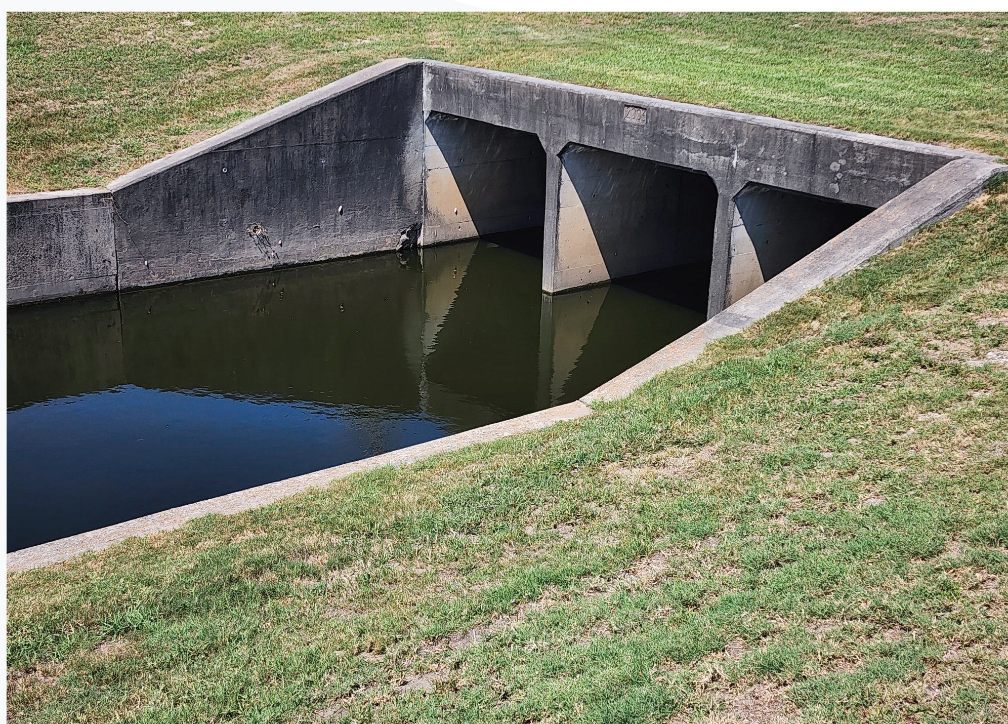
New culvert will be similar but double, not triple.